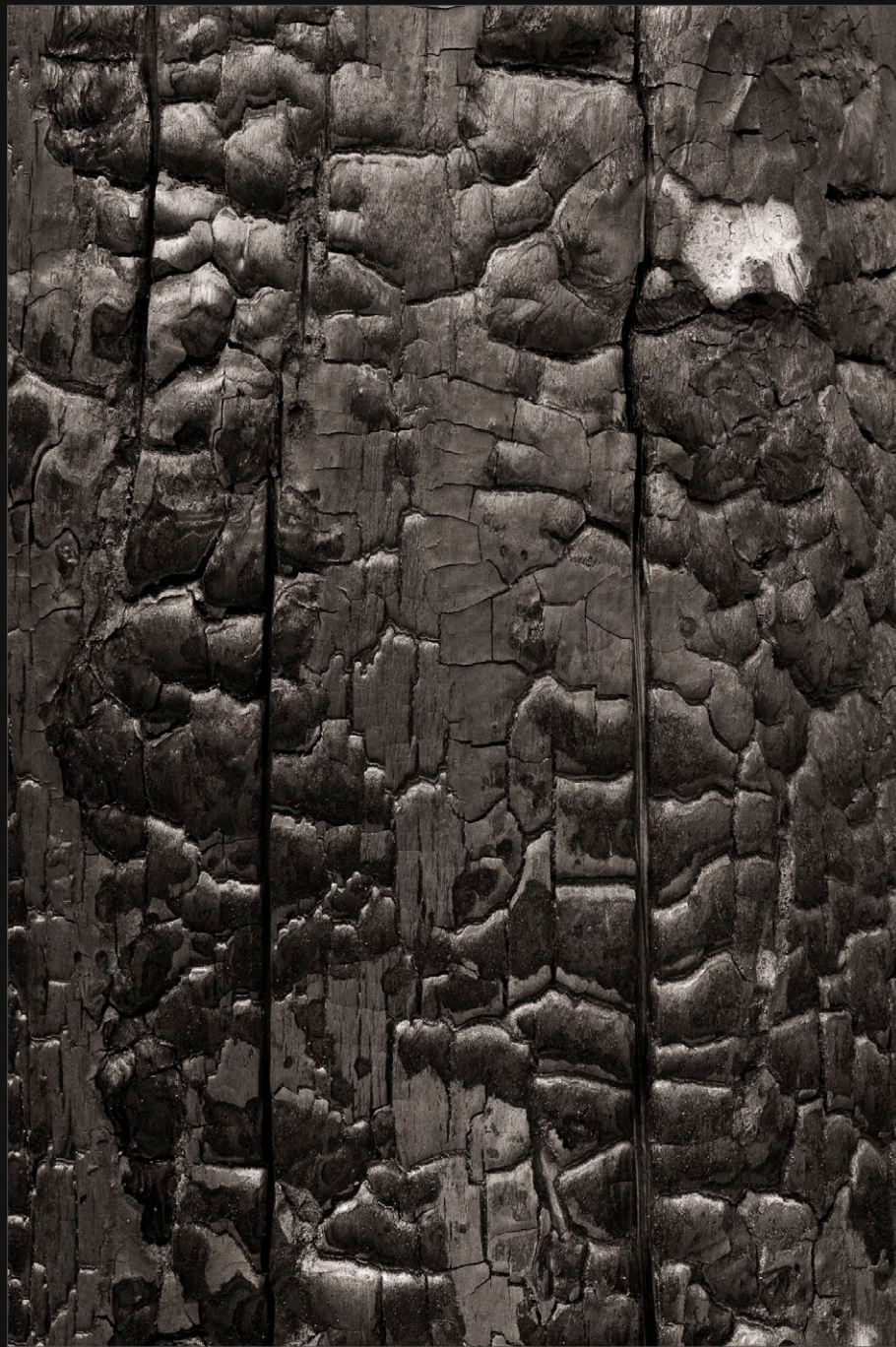
Burnt Trunk, 30-Mile Fire, Okanogan Forest, 2008