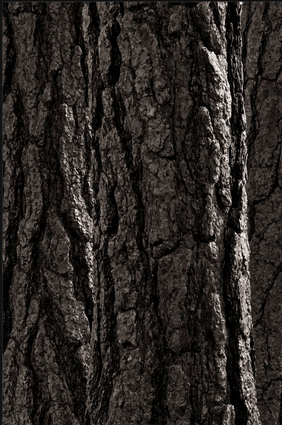
Three Ponderosas, Oregon, 2008