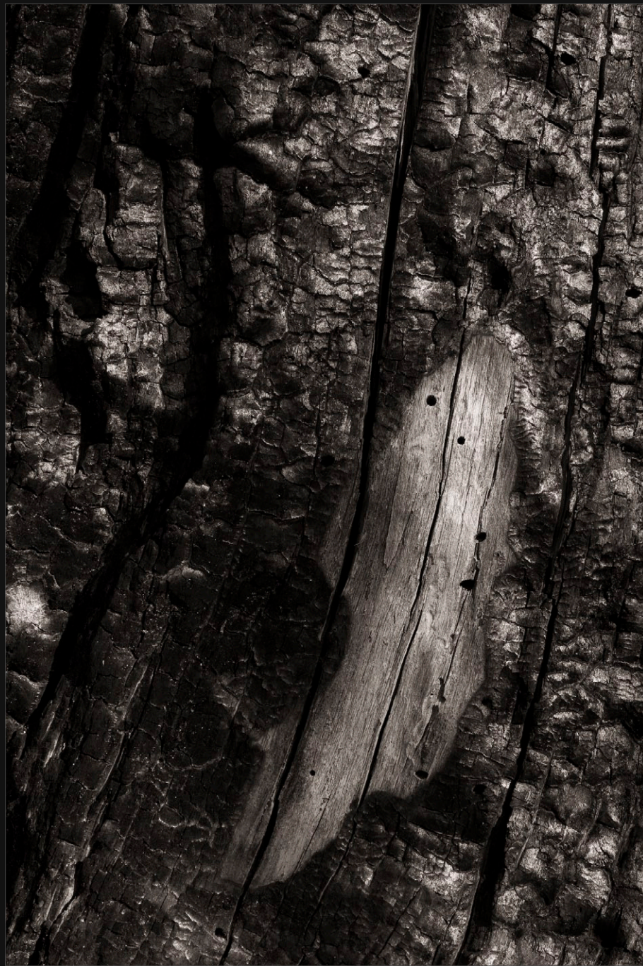
Wounded Bark, 30-Mile Fire, Okanogan Forest, 2008