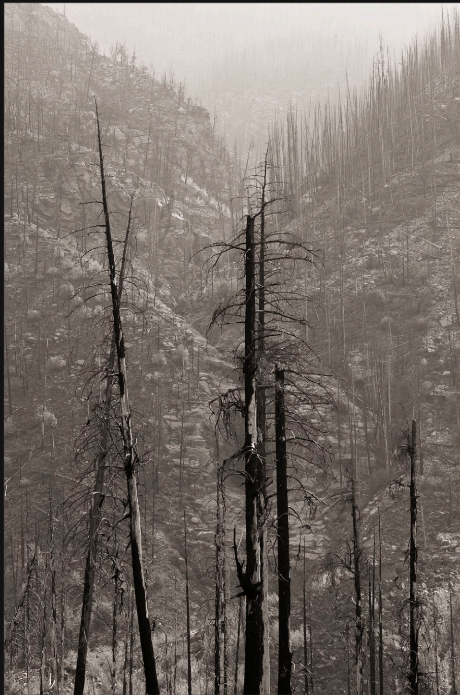
Remains, 30-Mile Fire, Okanogan Forest, 2008