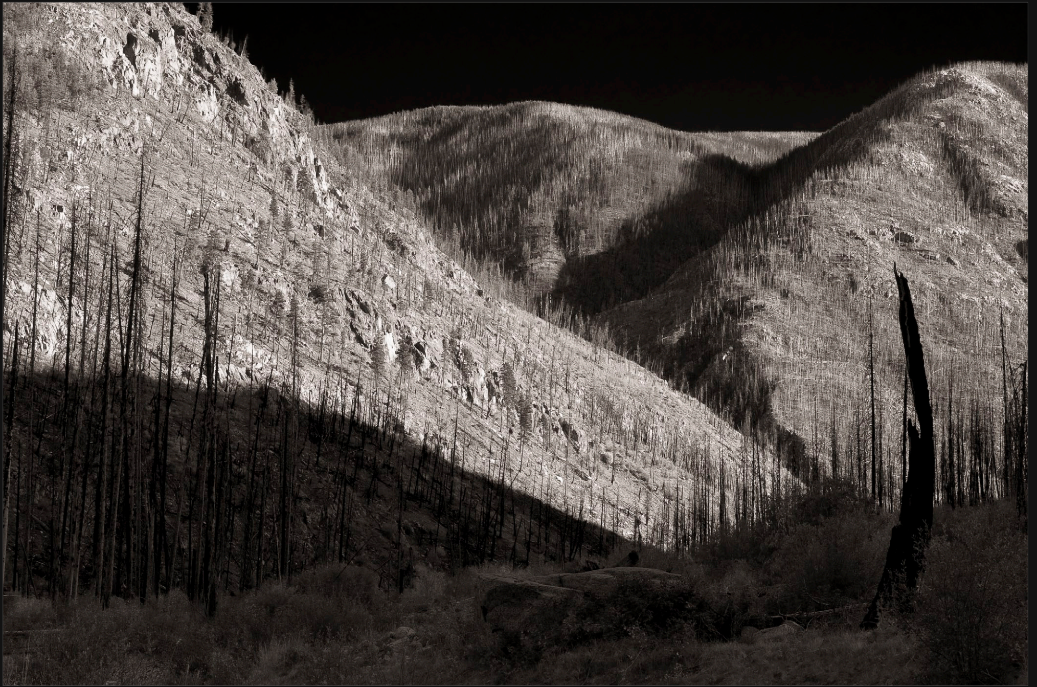
Okanogan Hills, 30-Mile Fire, Upper Methow Valley, 2008