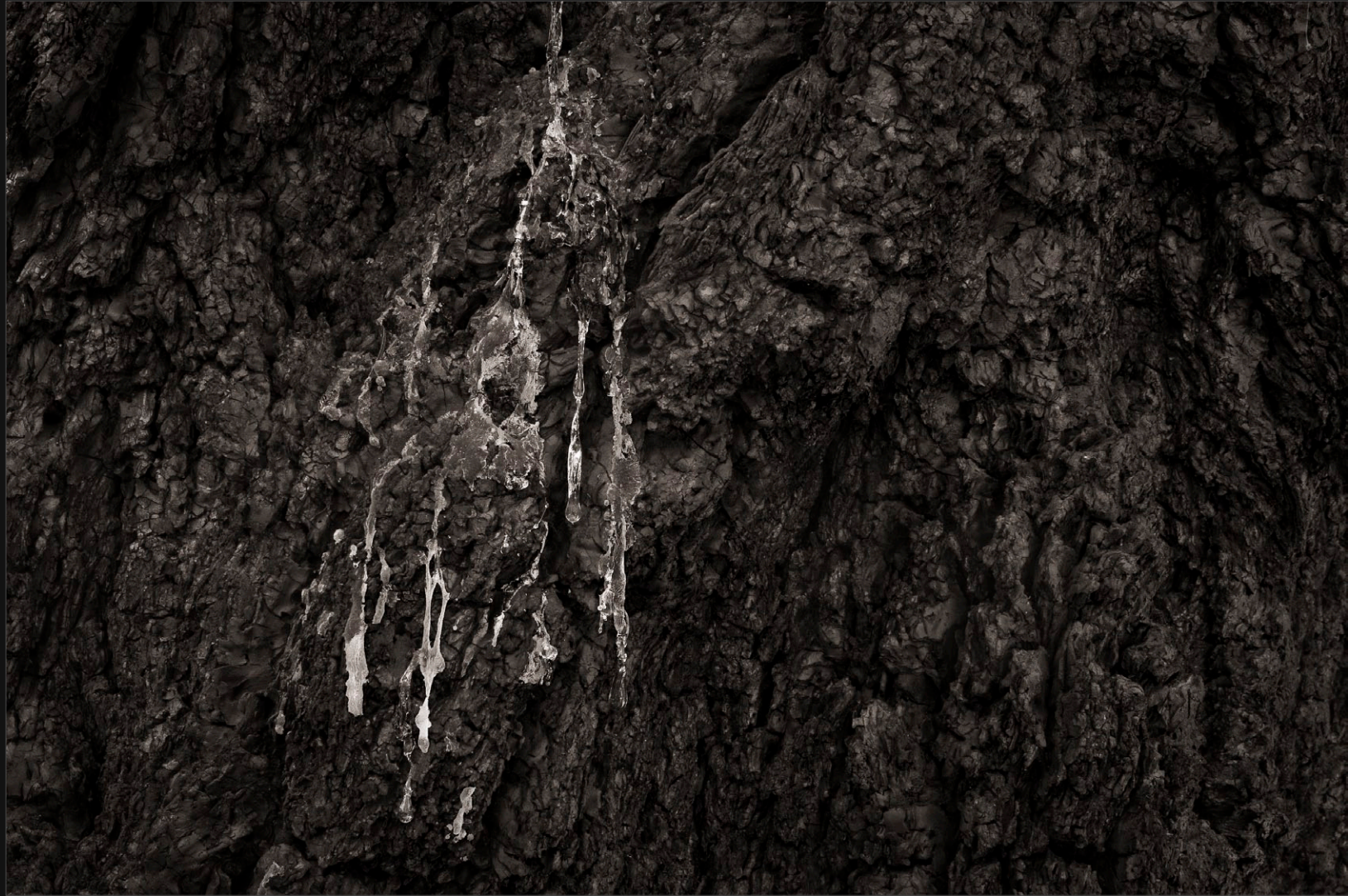
Tears of the Forest, 30-Mile Fire, Okanogan Forest, 2008