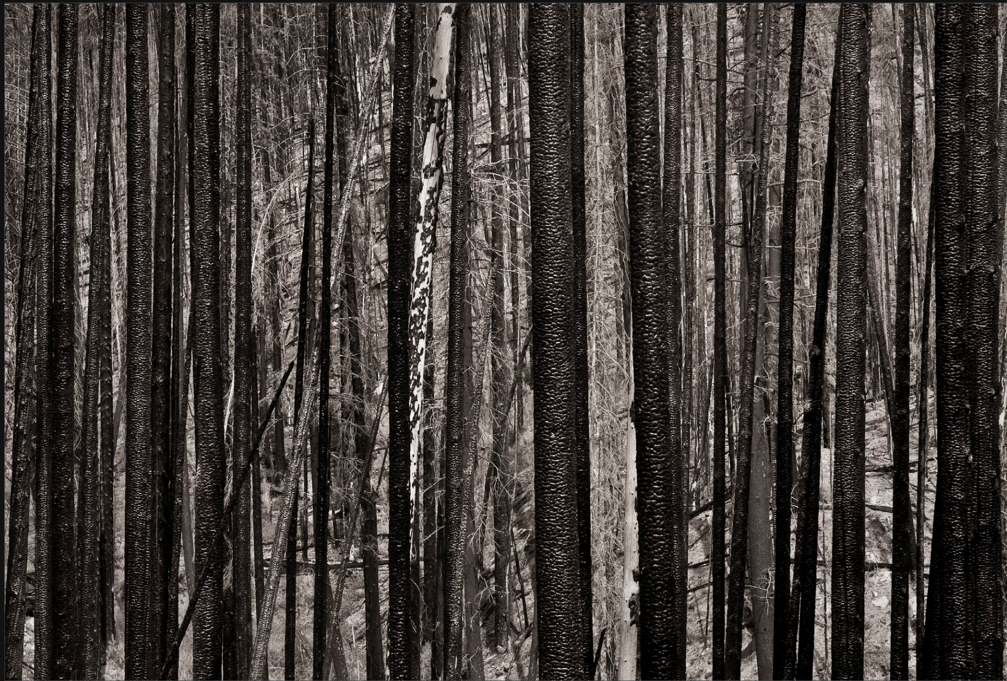
The Black Forest, 30-Mile Fire, Okanogan Forest, 2008