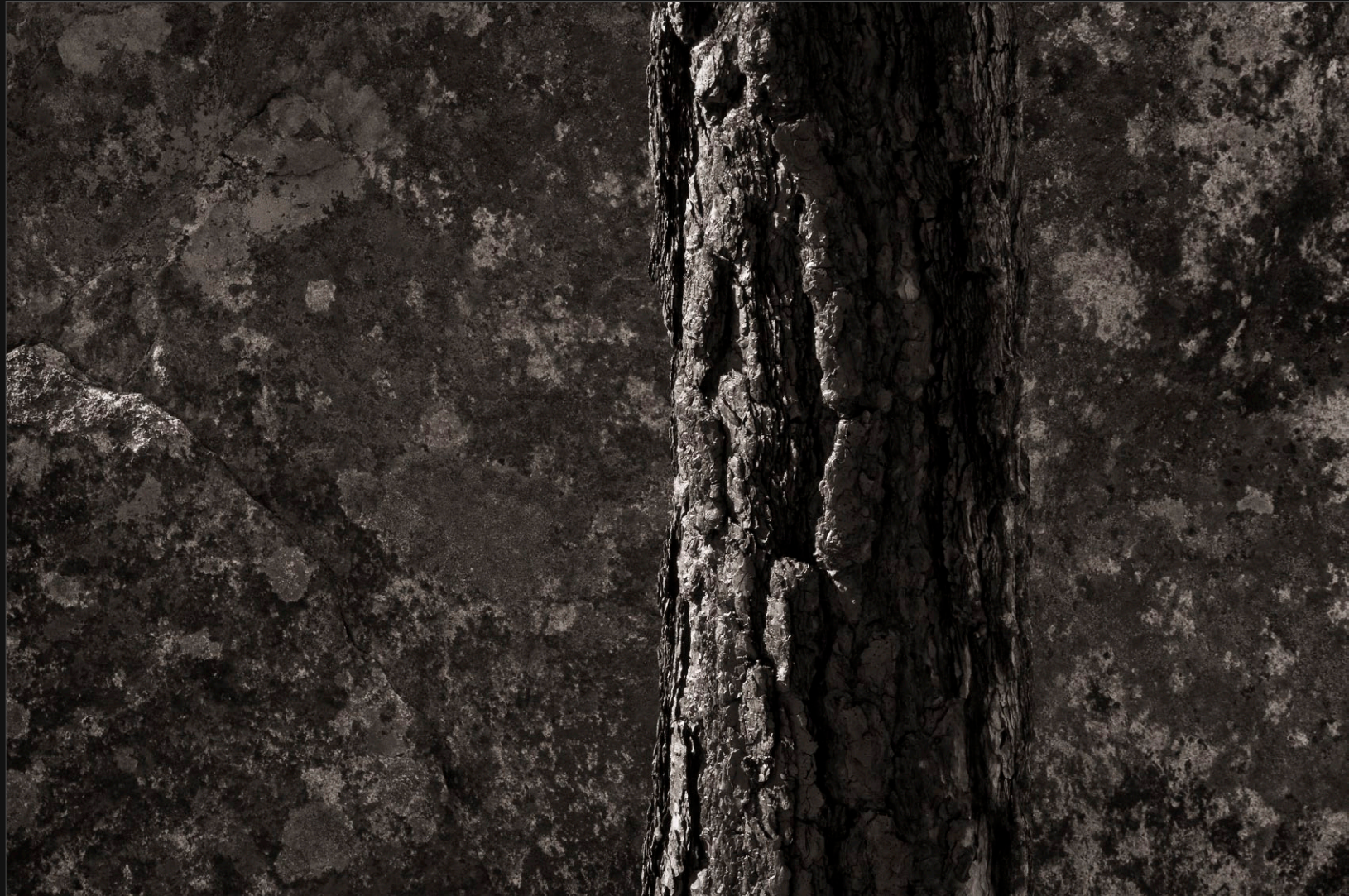
Charcoal and Granite, 30-Mile Fire, Okanogan Forest, 2008