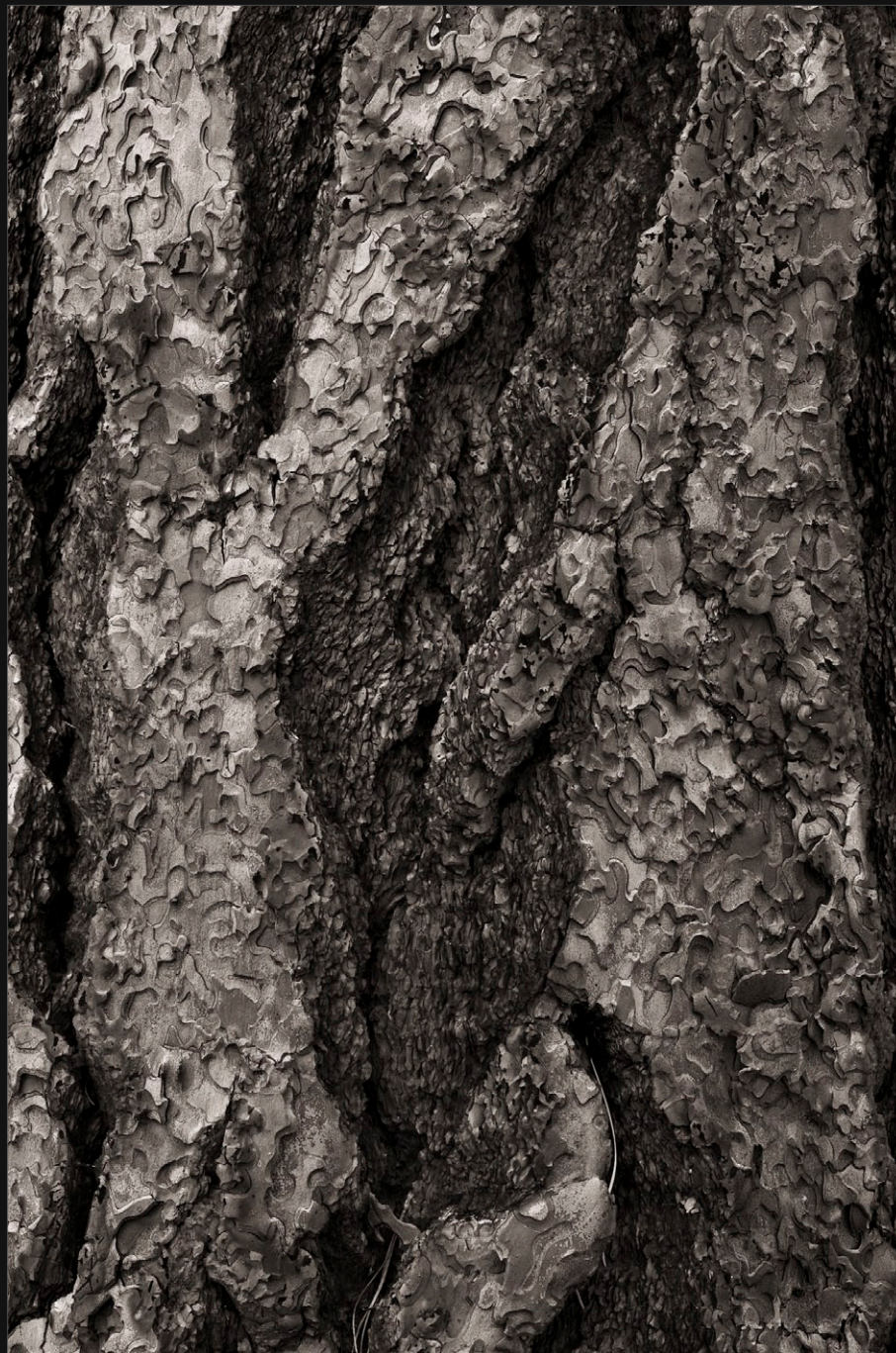
Bark Flourish, 30-Mile Fire, Okanogan Forest, 2008