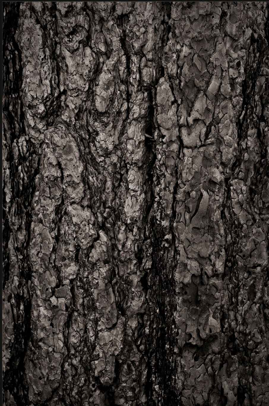
Ponderosa Textures, Oregon, 2008