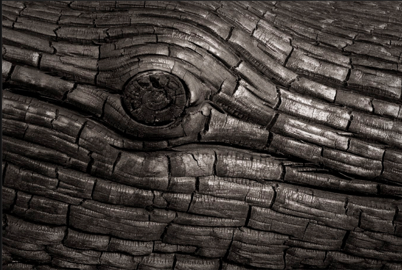
The Watcher, 30-Mile Fire, Okanogan Forest, 2008